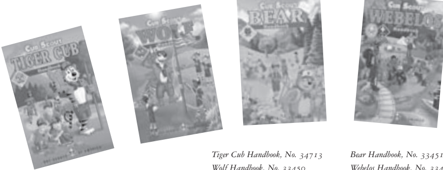
Tiger Cub Handbook, No. 34713 Wolf Handbook, No. 33450